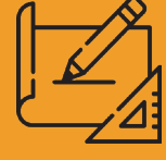
SPECIALTY DESIGN & FABRICATION